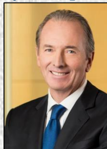
Mr. James P. Gorman Chairman & CEO Morgan Stanley