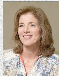
Ambassador Caroline Kennedy Former US Ambassador to Japan